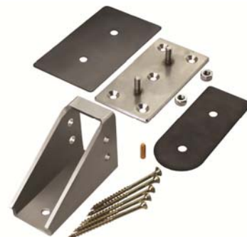
Shear-Fix LF 600