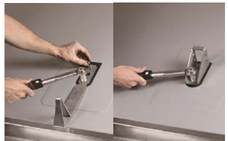
Tighten M10 nuts with 20 Nm to 24 Nm

5. Check the tightness of the nuts twice over a period of 24 hours and retighten if necessary.