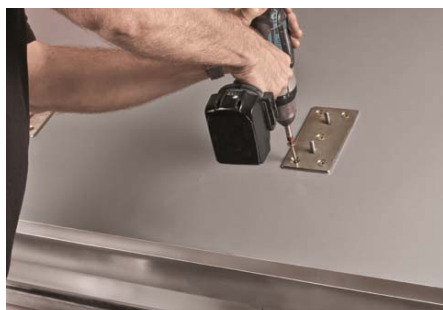
Tighten base plate

delivery. The screw holes should be pre-drilled with 5 mm.