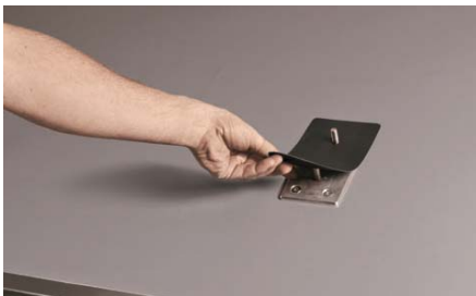
Place larger EPDM intermediate layer

Note: It is not allowed to use any waterproofing membranes laminated with separating or protective sheets from below.