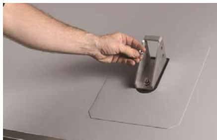
Set Shear-Fix LF 600 over threaded bolt