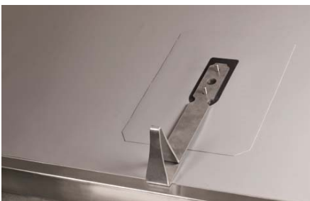
Set Shear-Fix LF 300 over threaded bolt

We recommend using a torque wrench to ensure the required tightening values.