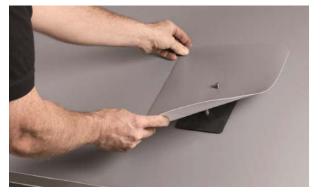
Punched blank piece of membrane