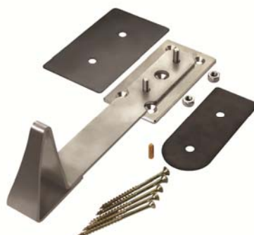
Shear-Fix LF 300